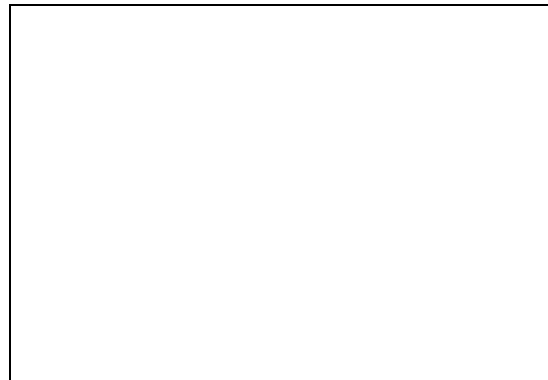
Health Professional's Stamp

If the stamp above does not contain all of the following information, please complete as appropriate: